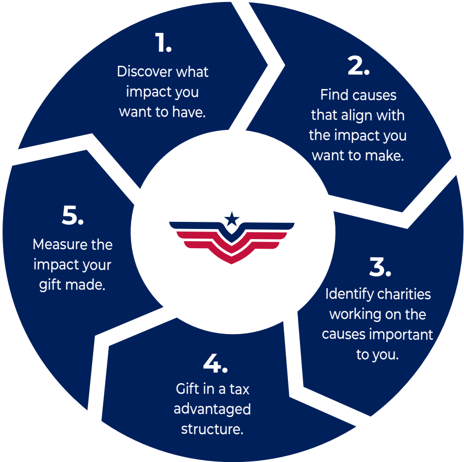
CHARITABLE GIVING CYCLE

Client First Capital can help you implement a structure and ongoing process to build and sustain your family’s legacy planning. Give us a call if you would like help realizing your family’s charitable giving and impact goals. We’re here to help.